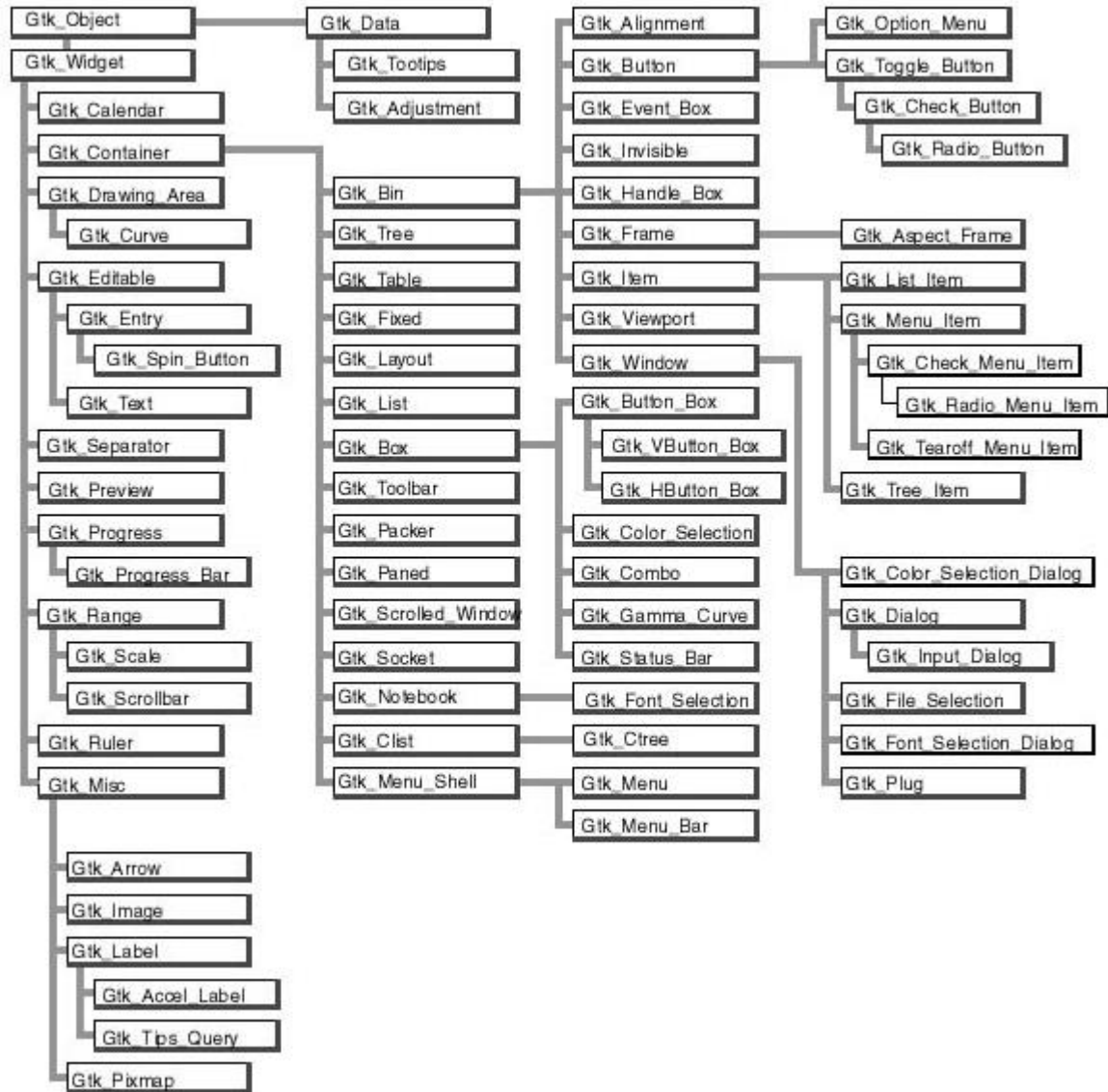
Fig. 1: Widgets Hierarchy